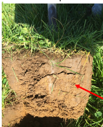
2019 soil profile

2023—After long periods of water-logged and inundated conditions and of course no air able to enter the soil the soil dug up by Bob in November had very good aggregation and structure.