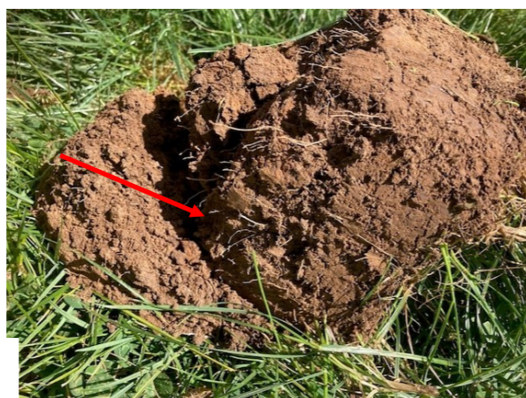
2023 photo taken in same area